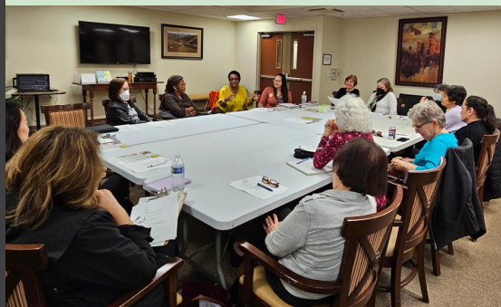
Oct. 24 advisory board meeting