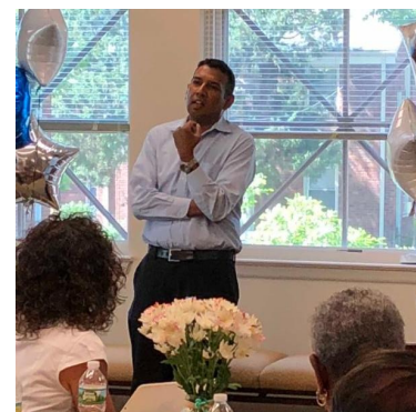
Teaneck Mayor Mohammed Hameeduddin commits to address older adult challenges

Come support these township fundraisers!