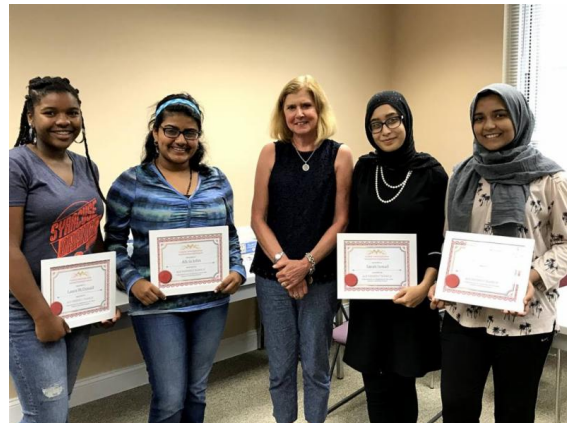
Our Interns with their "Graduation" Certificates

Four Teaneck High School students spent four weeks this summer with geriatric professionals in Teaneck. They toured hospital and nursing home wings, spent time with older adults and learned about many disciplines of care. They gained a lot from the experience, from career awareness to a better understanding of their own grandparents.